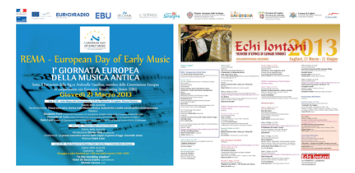
EDEM in Cagliari, Italy - Echi Lontani